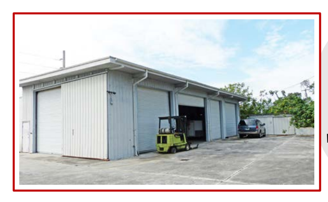
Additional Photos Available on our Website: